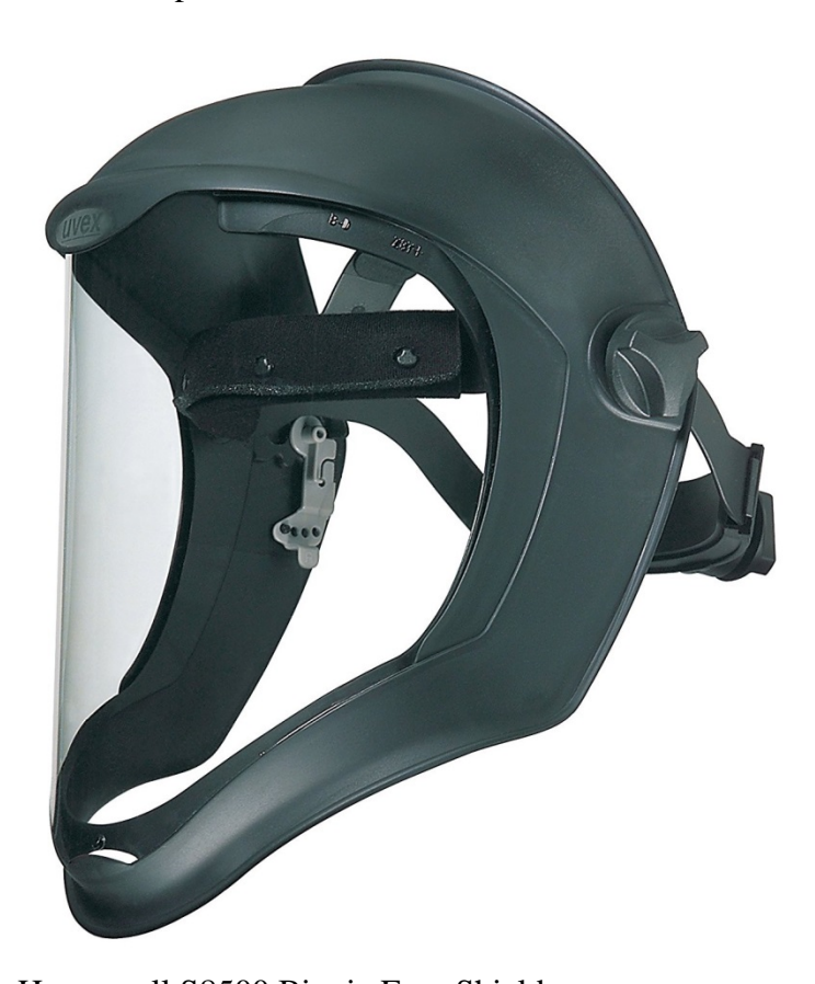
Honeywell S8500 Bionic Face Shield

Face Protection. There will be times when you need more than eye protection. A face shield provides protection for your entire face and should be worn anytime there is the potential for a projectile being directed towards your face. Lathe work is a good example. But, be aware that not all face shields are created equal. Many are designed only to protect you from the splash of liquids. This type will not provide adequate protection. The face shield must be impact rated and be ANSI Z87 certified. The Honeywell S8500 Bionic face shield (Amazon.com) is an example of such a face shield. Note that the face shield is supported by a frame all the way around the perimeter.