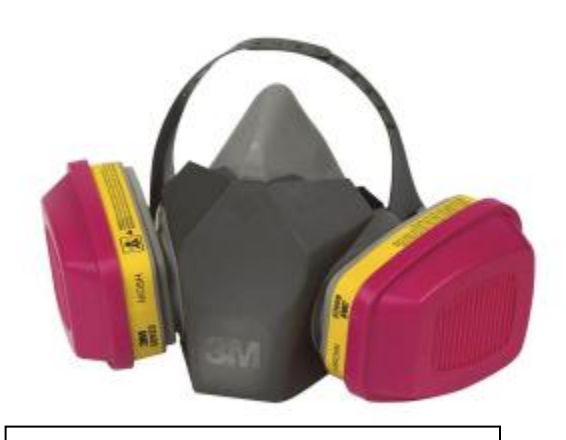
Organic Vapor (Yellow)/P100 (Purple) Combination Finishing Respirator

Use the flat pancake P100 filters (Purple) for dust (~$10/pair). P100 means that it is essentially 100% effective at removing respirable size dust particles. The organic vapor cartridge (Yellow) is good for finishing and staining operations that are done with a rag or brush (~$13/pair). For spray finishing you need the organic vapor cartridge/P100 filter combination cartridge (~$25/pair). These dust masks and cartridges are available from Home Depot, Grainger, Orr Safety, and McFeeleys. Lowe's carries respirators with a N95 dust filter which is only 95% efficient at removing respirable size dusts. Grainger sells the respirators in sizes small, medium and large. Most other suppliers sell only the medium size, which fits most people.